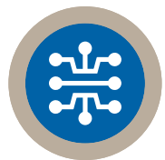
Technology and Innovation

For more details on all elements rated under RHFAC, check out the RHFAC Rating Survey .