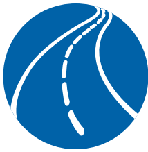
Paths of travel & base building entrances