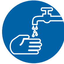
Sanitary facilities outside of renovated areas